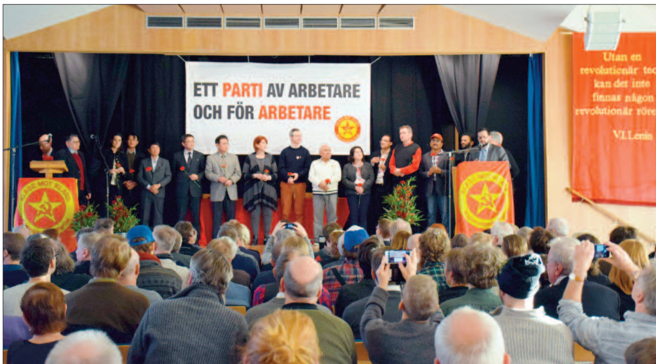
All international guests were welcome on stage at the first day of the congress.